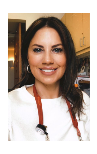
Administrative Supervisor A Super Star