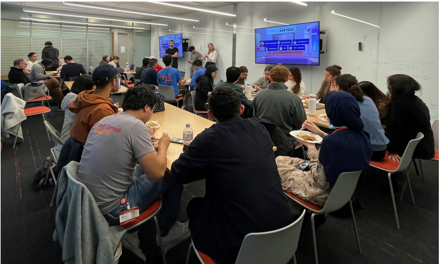
Infectious Disease (IDIG) Bug Bowl! (Trivia Night with Food and Prizes)